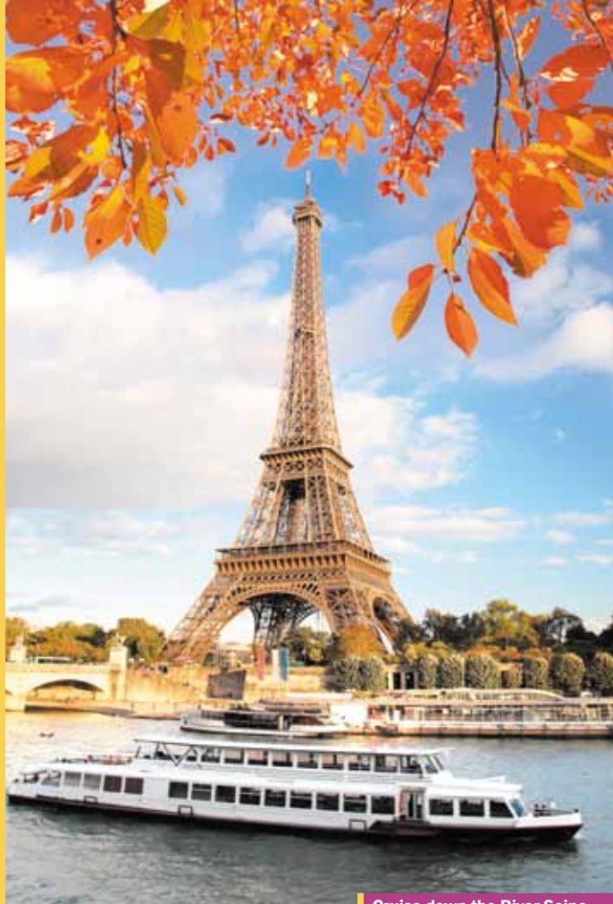
Cruise down the River Seine