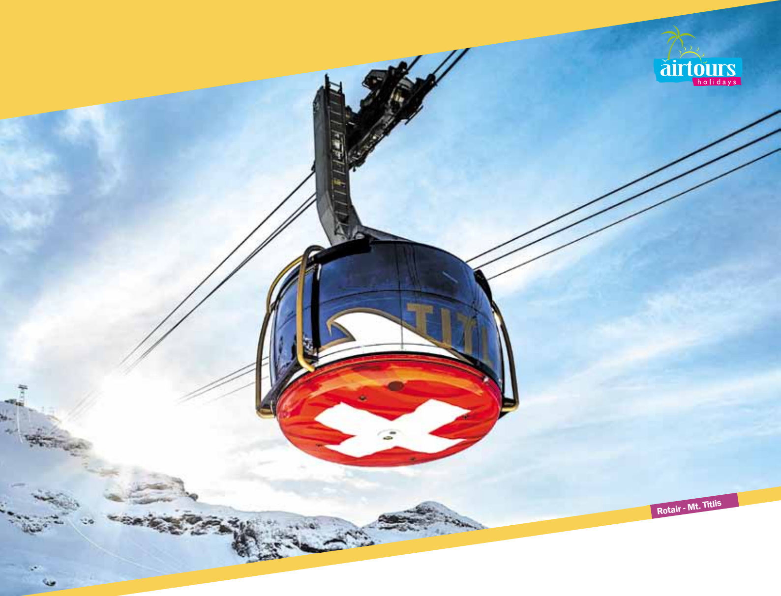
Rotair - Mt. Titlis