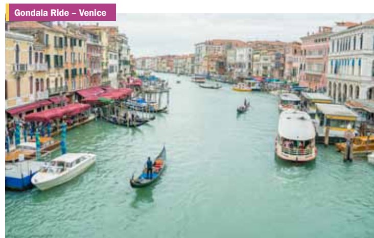
Gondala Ride - Venice

Enjoy a mini train ride that takes you around this quaint town. Drive to Engelberg. Tonight, enjoy an Indian dinner. Overnight Hotel Central / Dorint or similar in Zurich / Engelberg. (B,L,D)