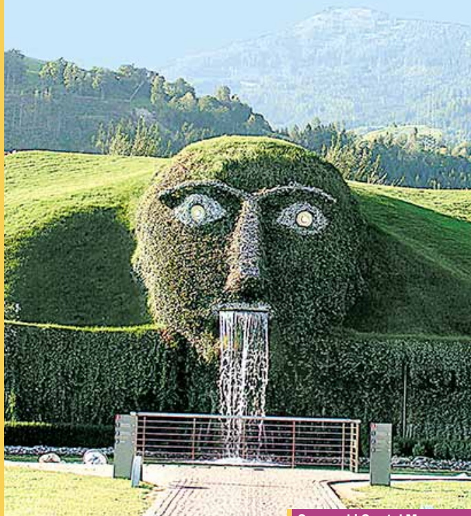
Swarovski Crystal Museum

proceed on a guided tour of this beautiful city. See the Basilica di Santa Maria del Fiore - The Duomo. See the 'Gates of Paradise' - The east doors of the Baptistery, the Campanile and marvel at the open air sculpture museum in Piazza Della Signoria and many more sights. Also, see the Ponte Vecchio - a medieval bridge over the River Arno. Get a bird's eye view of Florence from Piazzale Michelangelo where you can also see the statue of David, one of Michelangelo's masterpieces. Tonight, enjoy an Indian dinner.