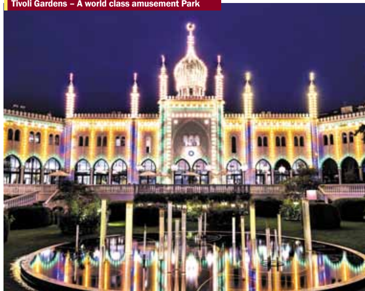
Tivoli Gardens - A world class amusement Park

After a buffet breakfast, check out and proceed on a guided city tour with a local English speaking guide. Visit the Christiansborg Palace - the most important building in Denmark. The Christiansborg Palace is the seat of the Danish Parliament, the Danish Prime Minister's Office and the Danish Supreme Court. Also, See the City Hall, the Amalienborg Palace - the winter home of the Danish royal family, the Stock Exchange, Strøget Shopping Street and many more sights. After lunch, visit the Gefion Fountain - the largest monument in Copenhagen which is also used as a wishing well and the Little Mermaid - an icon and major tourist attraction of Copenhagen.