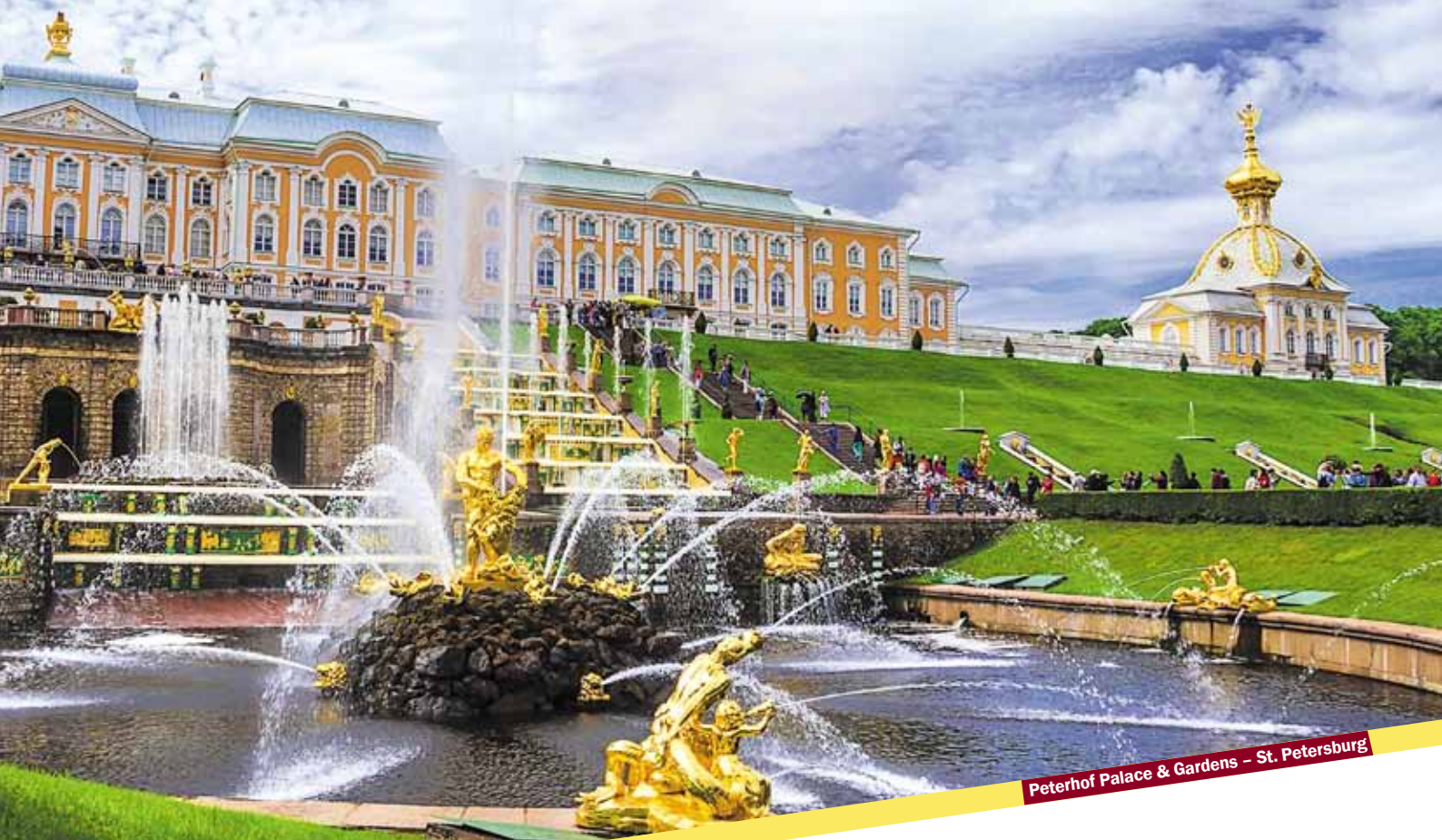
Peterhof Palace & Gardens - St. Petersburg