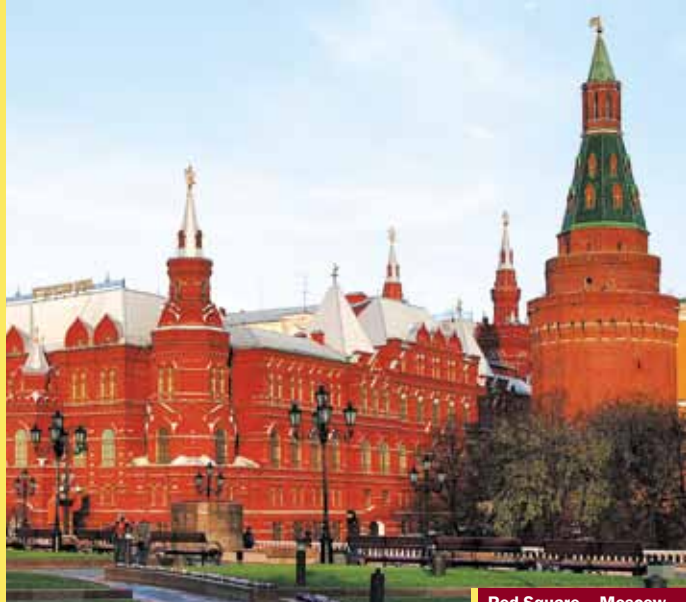
Red Square - Moscow