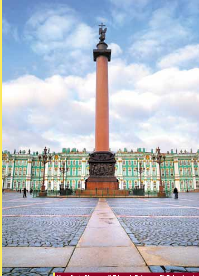
Hermitage Museum & Triumph Column – St Petersburg

harbor. Later, visit the famous Vasa Museum, housing the majestic 17th century royal warship Vasa. Tonight, enjoy a dinner.