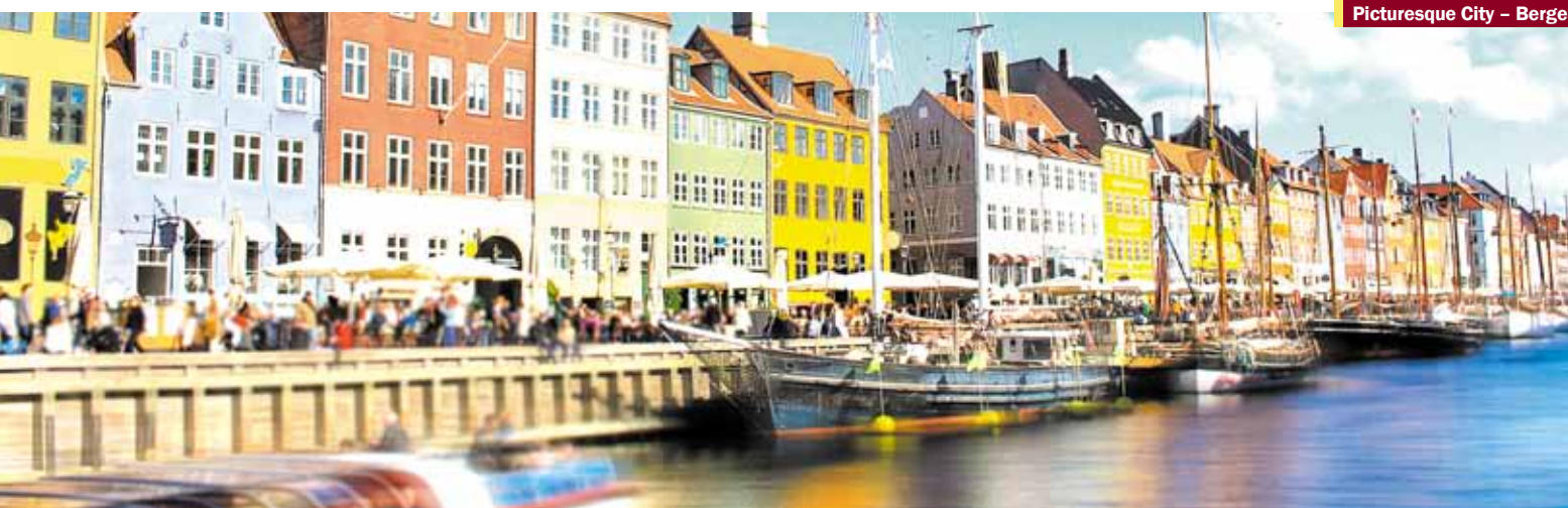
Picturesque City – Bergen

Overnight at hotel Holiday Inn Moskovskye Vorota or similar in St Petersburg (B,LL,D)