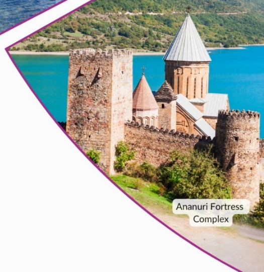
Ananuri Fortress Complex

B: Breakfast, L: Indian Lunch, LL: Local Lunch,