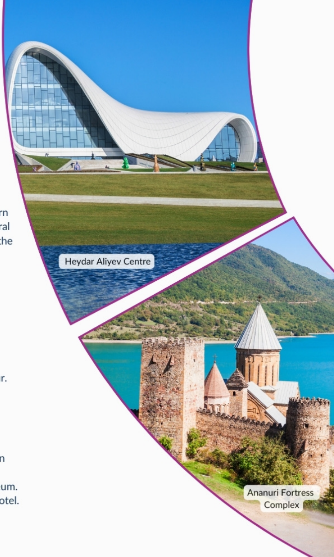
Heydar Aliyev Centre