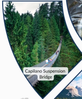
Capilano Suspension Bridge