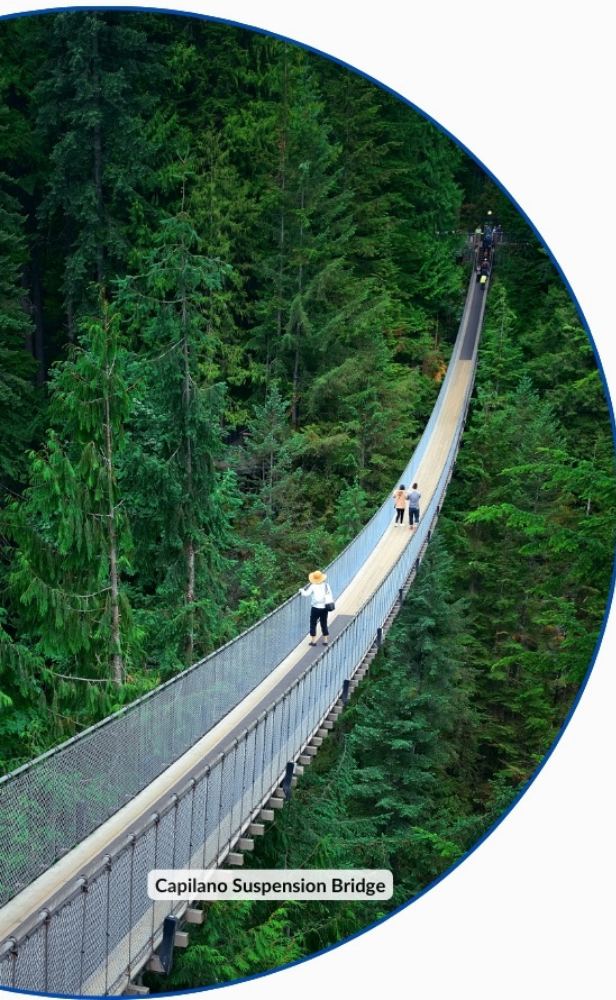
Capilano Suspension Bridge

After buffet/boxed breakfast, proceed for an exciting excursion to Victoria. Victoria, capital of British Columbia, sits on the craggy southern end of Vancouver Island.