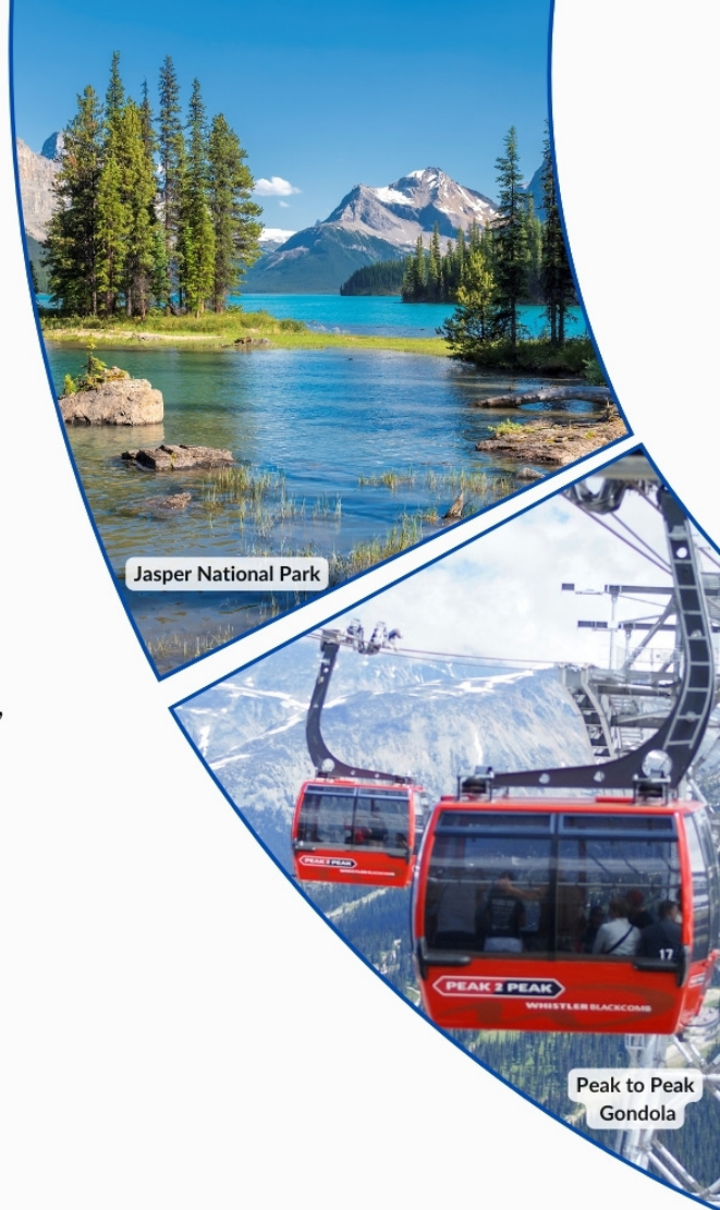
Jasper National Park

After breakfast, visit the Jasper National Park – the largest in the Canadian Rockies and see the spectacular scenery. After a basic lunch, proceed to Kamloops – Canada’s friendliest city. The spectacular drive will expose you to stunning sights like Mount Robson – the highest peak in Canada, the Monashee and Caribou Mountains. Drive over the Yellowhead Pass and arrive into Kamloops. Tonight enjoy an Indian dinner. Overnight in Kamloops. (B,L,D)