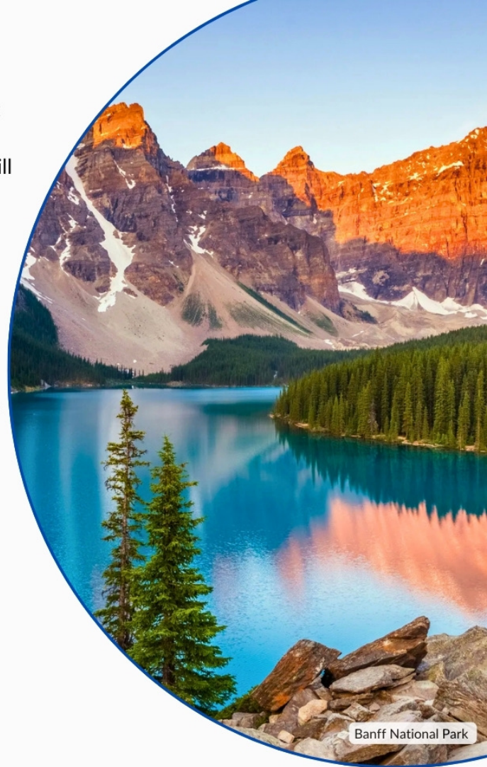
Banff National Park