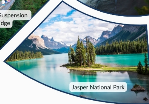
Jasper National Park