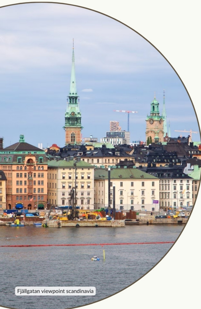
Fjällgatan viewpoint scandinavia

After a buffet breakfast, check out and visit the Drottningholm Palace - a former Royal summer residence and today home to the Swedish Royal Family. The palace contains magnificent rooms dating back to the 17th, 18th and 19th centuries, beautiful Baroque Park, Palace Theatre, Chinese Pavilion, etc. Enjoy Indian lunch. Later, board the 'Tallink Silja Line' on your overnight cruise. Cruise across the Baltic Sea and through the Swedish archipelago to Helsinki. Tonight, enjoy a Scandinavian buffet dinner on the cruise. Later, you can dance the night away in the nightclub, linger in the various shops as you enjoy the night on this cruise. Tonight, enjoy a Scandinavian buffet dinner. Overnight on board Tallink Silja Line Cruise Liner (B,LL,D)