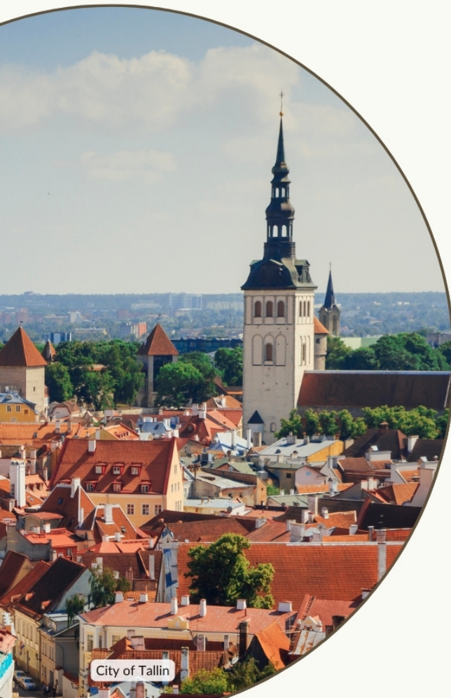
City of Tallin