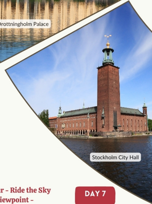
Stockholm City Hall

After a buffet breakfast, check out and drive to Karlstad. On arrival, enjoy local lunch. Karlstad is situated on the river Delta where Sweden's longest river, Klarälven, runs into Sweden's largest lake, Vänern. It is reputed to be one of the sunniest towns in Sweden and hence the symbol for Karlstad is a happy sun. Later, drive to Stockholm, the capital of Sweden, often called the Venice of the North due to its numerous canals and waterways. The city offers many interesting cafes and restaurants and has become an Eldorado for shoppers. Tonight, enjoy an Indian dinner. Overnight in Stockholm (B,LL,D)