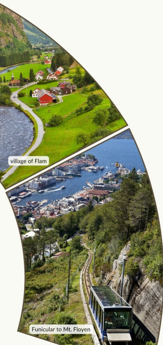
village of Flam