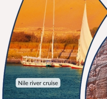
Nile river cruise