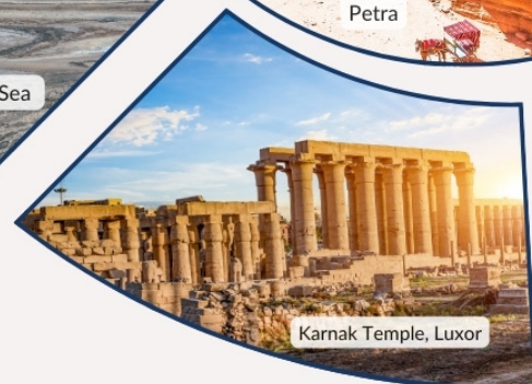
Karnak Temple, Luxor