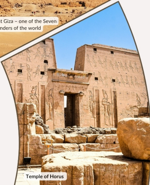
Temple of Horus