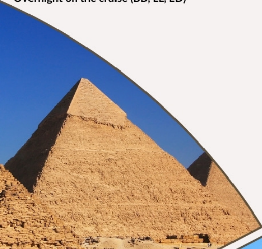
Pyramids at Giza - one of the Seven Wonders of the world