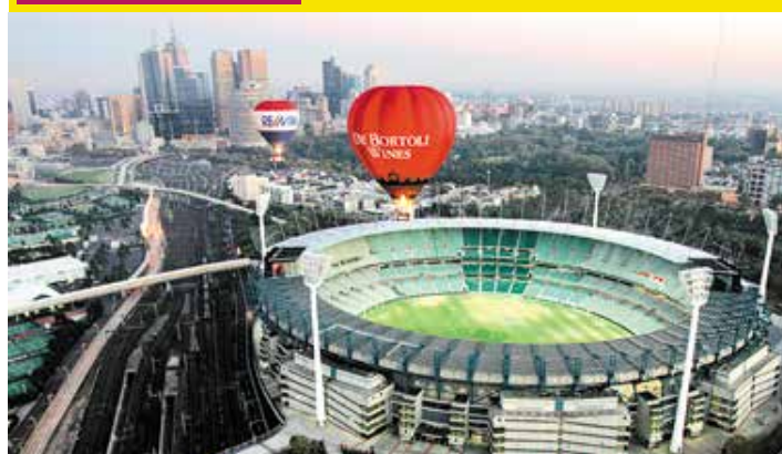
Melbourne Cricket Ground