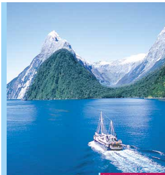
Cruise on the Milford Sound