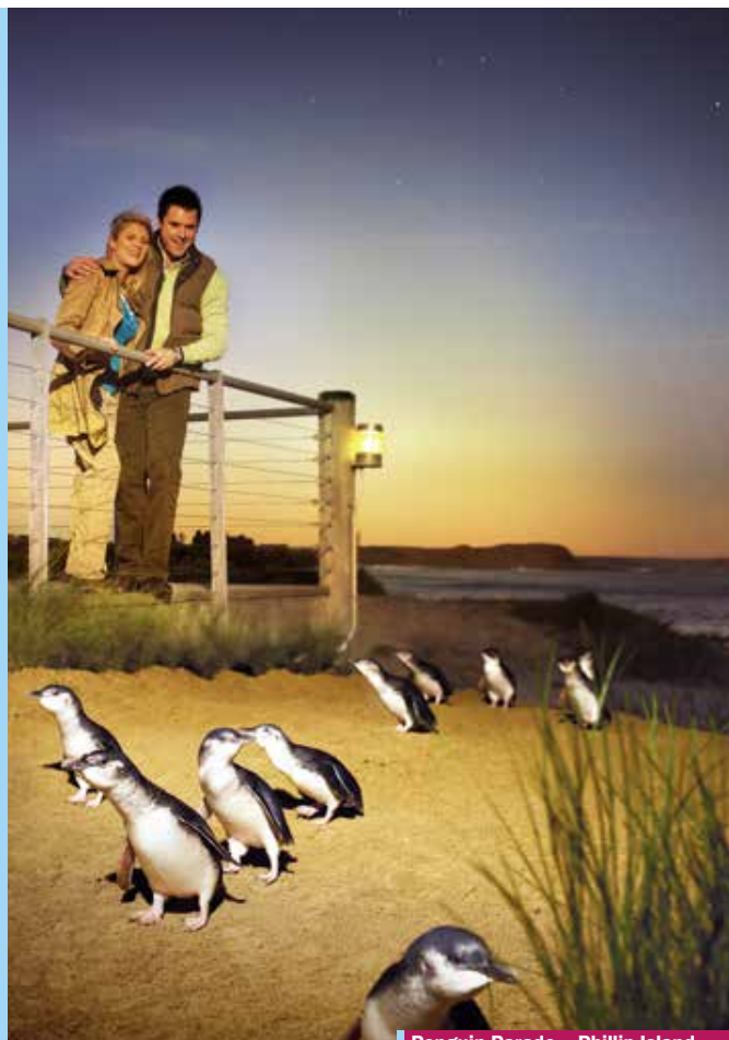
Penguin Parade – Phillip Island